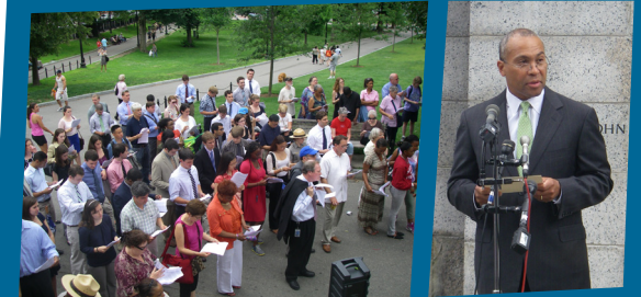
Scenes from a recent Reading Frederick Douglass event at the State House

Open & Honest is a new spin on the popular Reading Frederick Douglass program, where public community readings of Douglass's famous Fourth of July speech take place around Independence Day. To find a RFD event near you, go to masshumanities.org .