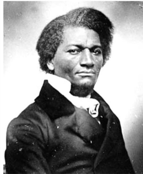
Frederick Douglass

Frederick Douglass's address "What to the Slave is the 4th of July?" forces us to reckon with the legacy of slavery and the promises of democracy. It is important to acknowledge that reciting the words, and discussing its content and context can result racial or historical traumatization and re-traumatization for participants and audience members.